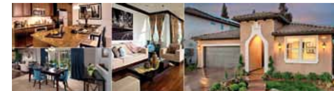
Photo of similar home

6/18/15 Granville Home of Hope Grand Prize Drawing , Belterra Community, Fresno – Tickets to win this beautiful home are $100 each. Hinds Hospice keeps 100% of the proceeds from tickets we sell. Other ticket sales are split between Hinds Hospice and nine other local non-profits. Visit www.HindsHospice.org for more information.